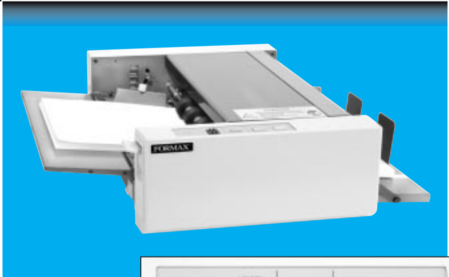
Operator Friendly Control Panel