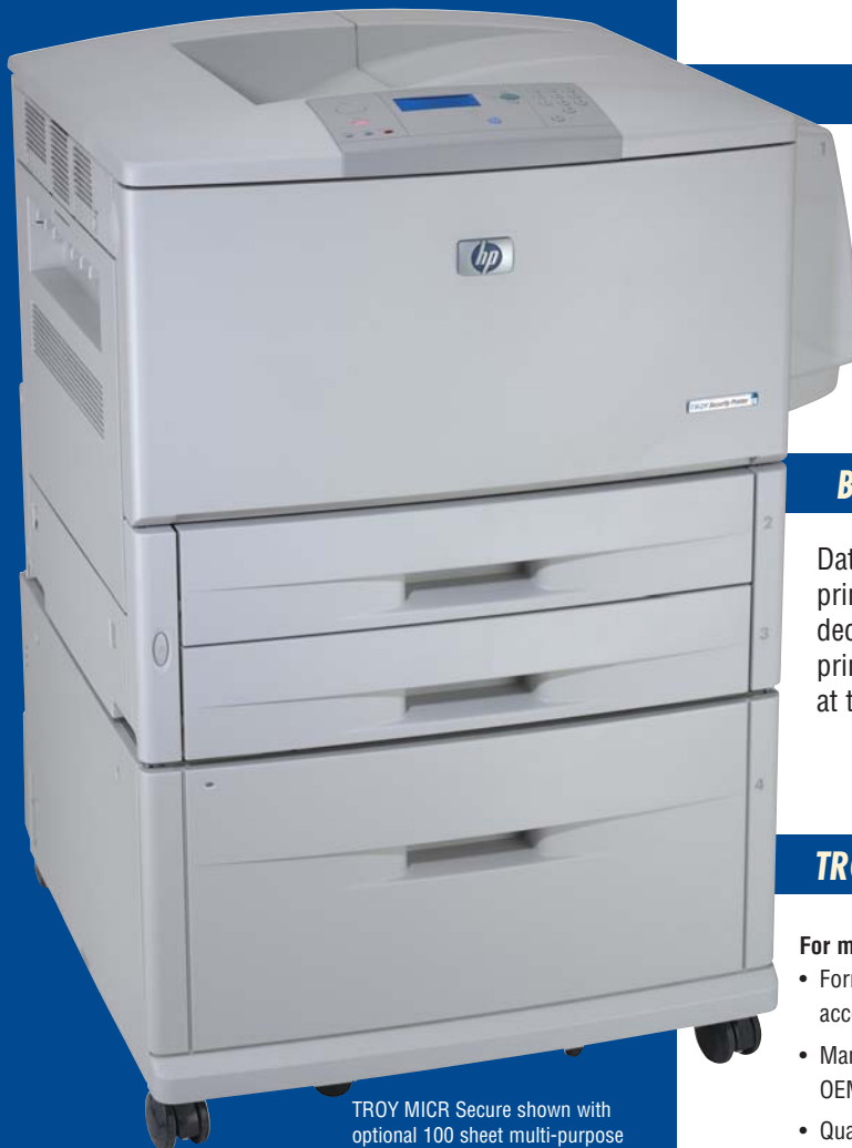
TROY MICR Secure shown with optional 100 sheet multi-purpose tray and 2,000 sheet input tray.