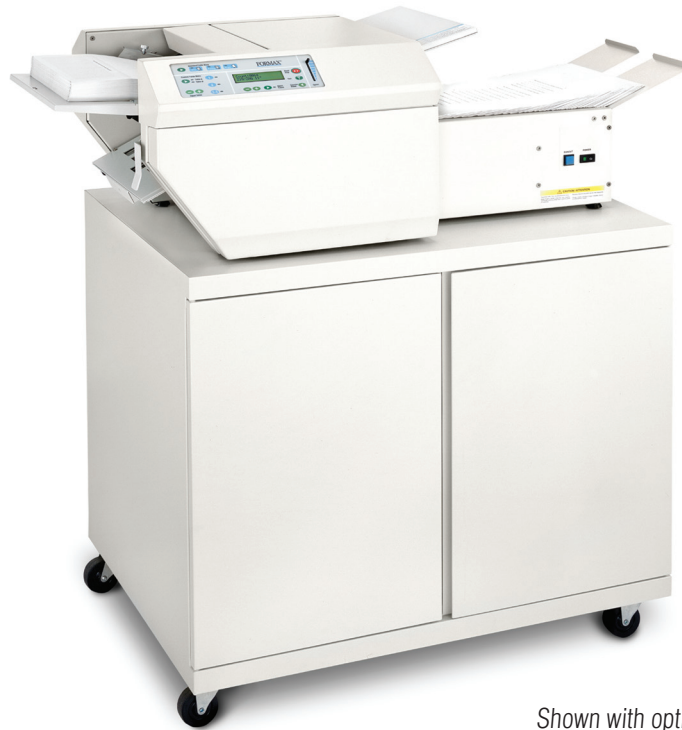
Shown with optional cabinet and 18" conveyor

The AutoSeal ® FD 2052 is a fully automatic pressure sealer which provides the ultimate solution for processing pressure sensitive self-mailers. Designed with ease of operation and efficiency in mind, the FD 2052 automatically detects and adjusts for 11" and 14" (Int'l Size A4) paper sizes and is pre-programmed for three popular folds: Z, C and Half folds. The FD 2052 also has the ability to store up to nine custom fold settings with the simple touch of a button.